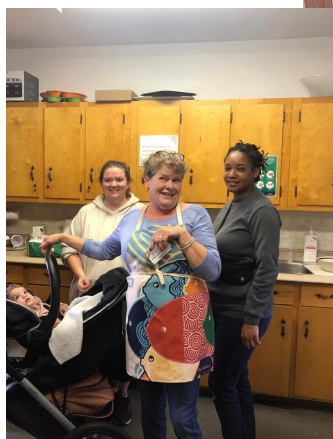
Volunteers from the Ward One Recreation Centre