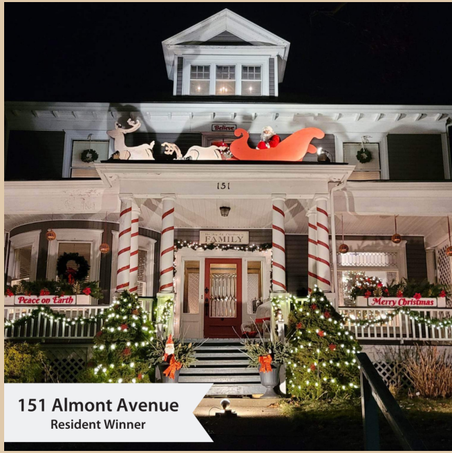
151 Almont Avenue Resident Winner