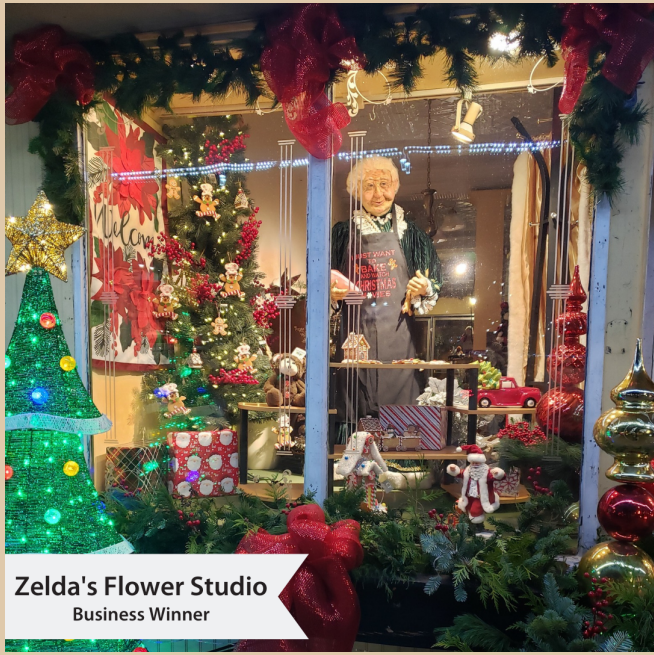
Zelda's Flower Studio Business Winner

A BIG congratulations to the winners of our Holiday Decorating Contest and thank you to all participants for entering. We hope everyone got the opportunity to see the many beautiful holiday light displays across our Town.